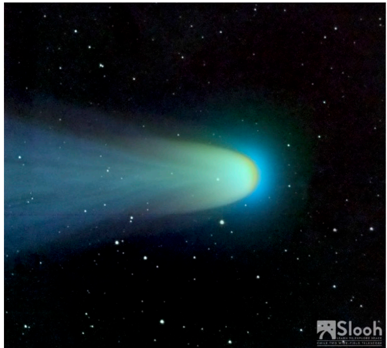
Comet C/2021 A1 (Leonard)

Speaking of health issues, I recently had a CT Angiogram which showed a significant blockage in one of my coronary arteries. I'm currently consulting with a couple of doctors to map out a treatment strategy.