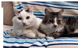
MELLO & CODA BEST BUDDIES ON THE COUCH